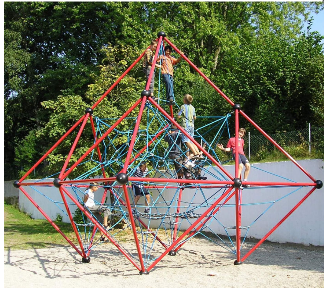
(Cad image shows Classic model, photo shows Triangulum model)